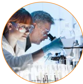
Pharmaceutical Key Account Managers