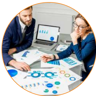
Medical Device & Digital Therapeutics Professionals