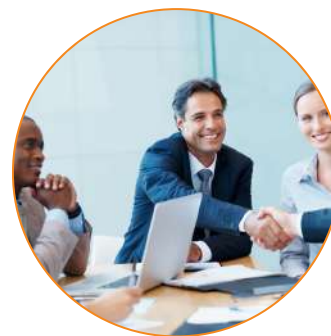
Market Access, Pricing & Policy Professionals