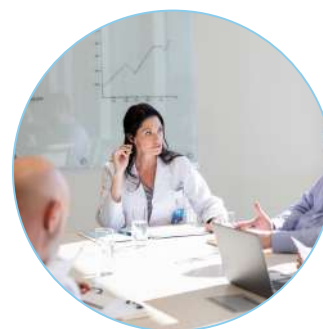
Public Health Professionals